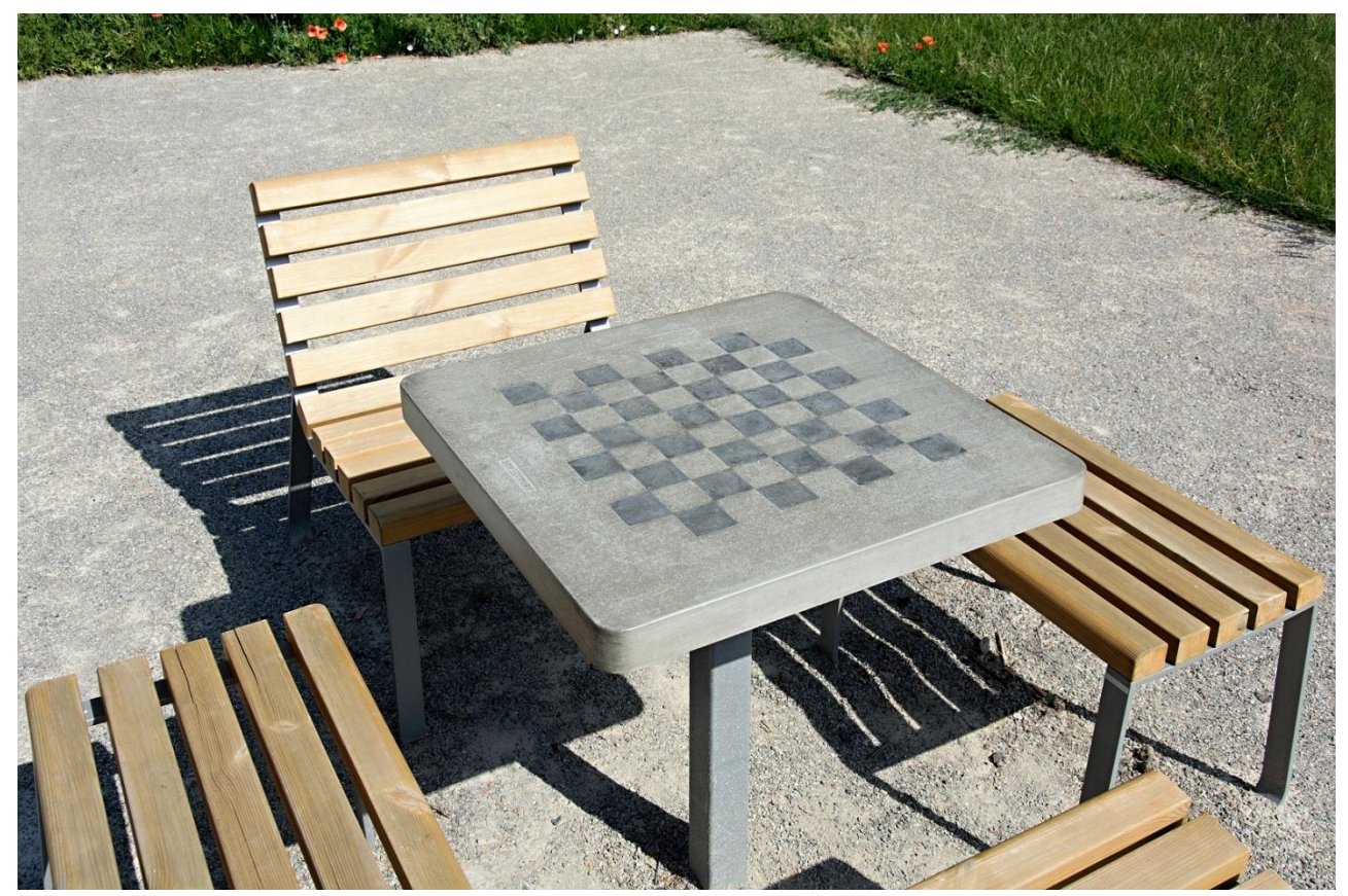
The picture is only illustrative, it may not exactly match the product described.