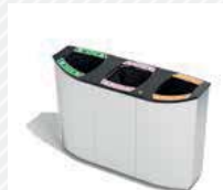
Recycling labels available.