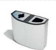
Aperture masks guides the user to recycle different waste fractions.