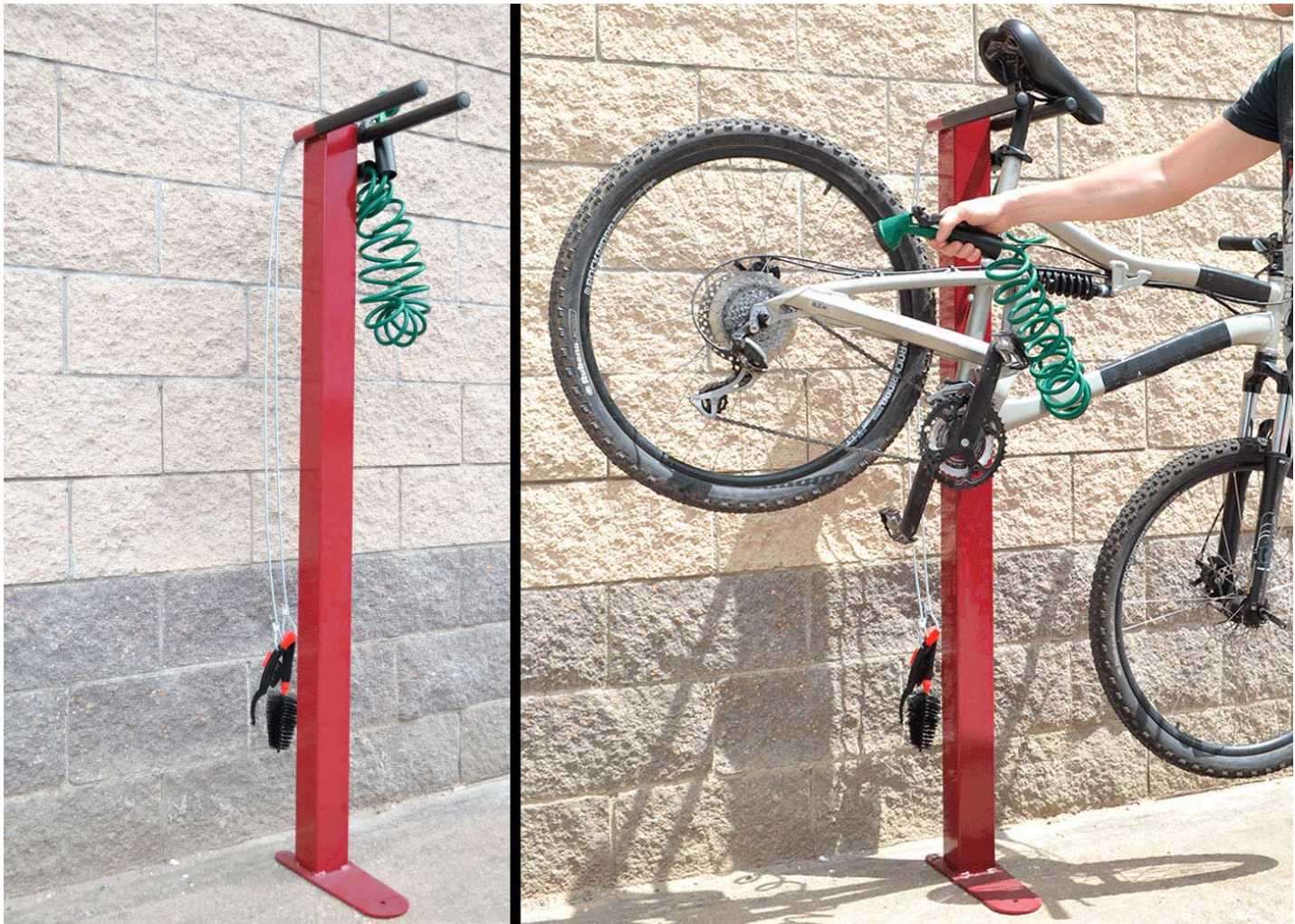
Washing station for bicycles. The bicycle is suspended to the top bars, allowing an optimal washing of the whole bicycle. Includes a connecting fitting to the water network with locking system and two brushes for cleaning the different parts of the bicycle.