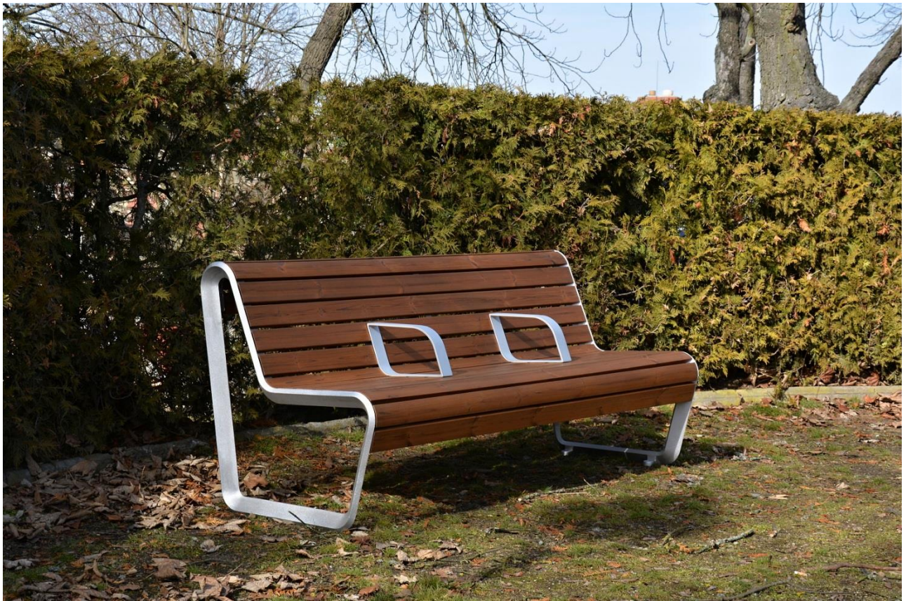
The picture is only illustrative, it may not exactly match the product described.