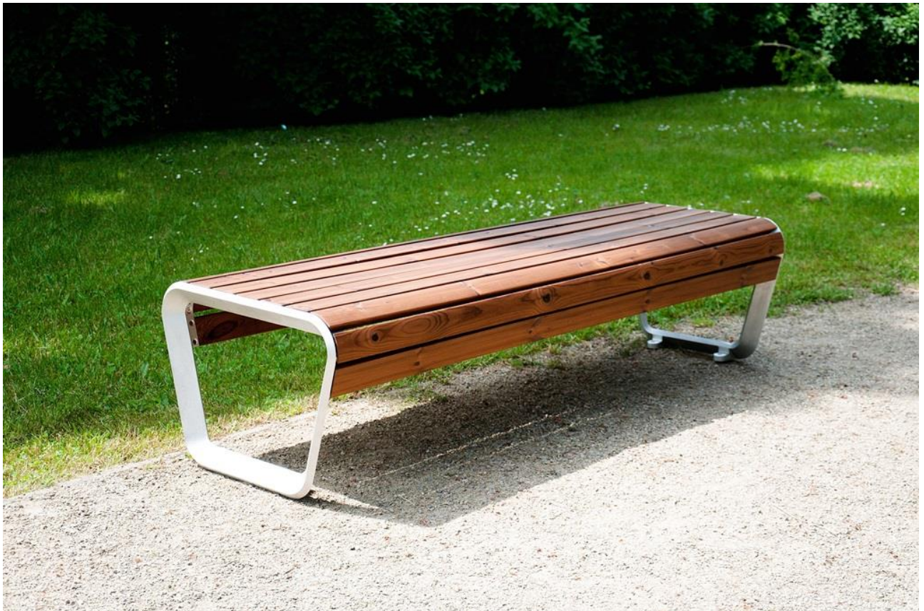
The picture is only illustrative, it may not exactly match the product described.