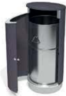
Basic models have hinged door with a lock

Novus 50, 80, 120, 160, 200 and FlipTop models. Available accessories for the fixing: ground post for embedding, post for the surface fixing, cylindrical pedestal, wall fixture, post fixture. The basic Novus bins can be equipped with a side ashtray tube.