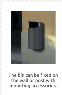
The bin can be fixed on the wall or post with mounting accessories.