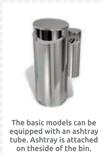
The basic models can be equipped with an ashtray tube. Ashtray is attached on the side of the bin.

Sloped and convex top drains water away and prevent users from leaving waste on top of the bin.