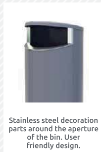
Stainless steel decoration parts around the aperture of the bin. User friendly design.