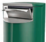
Hygiene hatch / dog chute