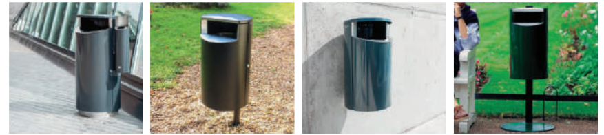
Metal and concrete bases Ground post Wall mount Plate post

The Novus, Ellipse, Unique and City outdoor litter bin series consist of different modules. One must choose the appropriate mounting method when purchasing the product. The following table provides a good overview of the Dambis product mounting alternatives and various accessories.